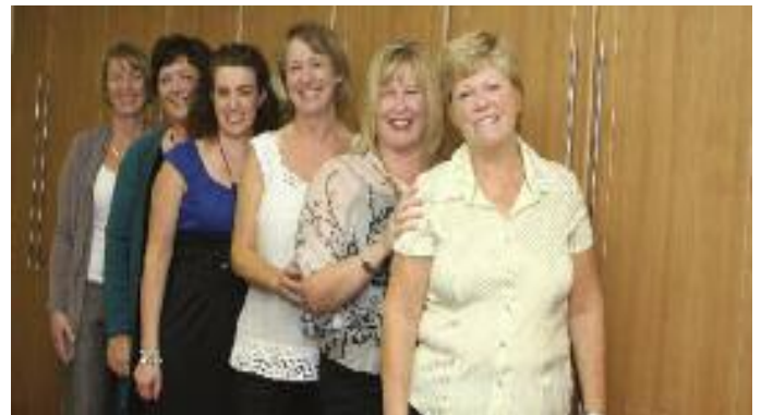
Staff of Malahide & District Credit Union Limited