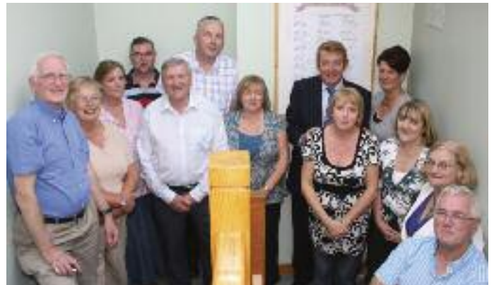
Current Board of Directors and Supervisors