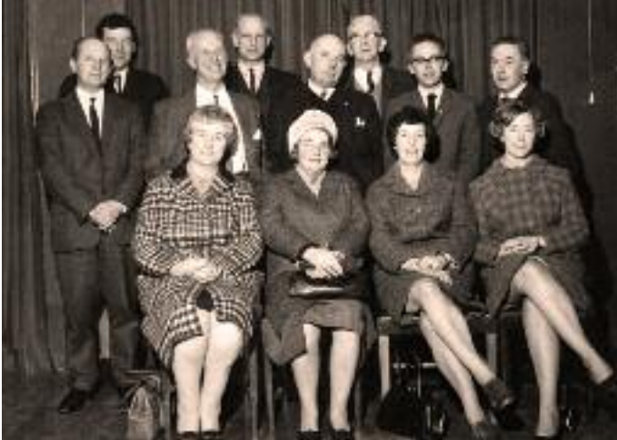
Original Founder Members of Malahide & District Credit Union Limited